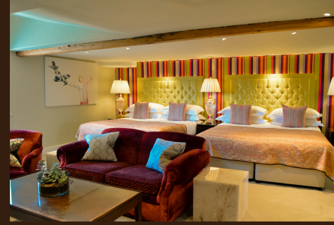
Two-Bed Loft Room