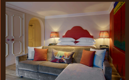
Hot Tub Junior Suite