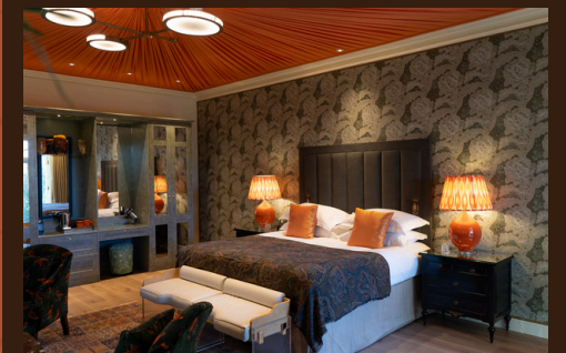
Luxury Hot Tub Suite